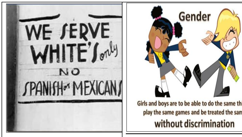
Figure 2. Gender stereotypes and discrimination (in Foulidi et al., 2020).